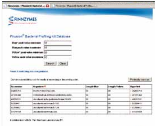
Figure 3. Access to the tailor-made database is included with the kit. Type the value of the blue peak and the corresponding yellow peak in the fields. The database lists the bacterial species or subgroups matching your search.

The database lists the bacterial species or subgroups matching your search. You can sort the results in ascending or descending order by clicking any of the column titles. Click the locus name in the Hyperlink column to access the NCBI GenBank entry for the given microorganism. To print the list, click “Printable version”.